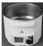
Table 3-2: Optional accessories (cont.)